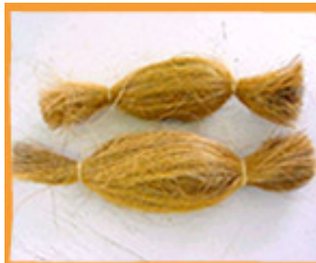
e rua pūhanga reng